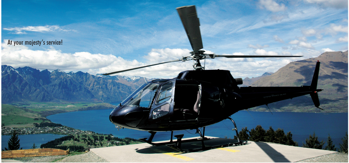
At your majesty's service!