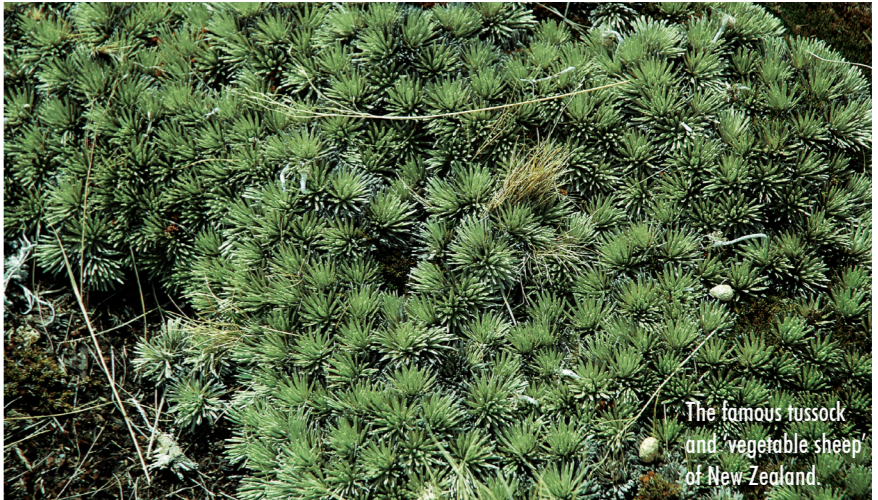
The famous tussock and 'vegetable sheep' of New Zealand.

Should I Be Good, and was involved in Sleeping Dogs, Beyond Reasonable Doubt, Songs For The Return Home.