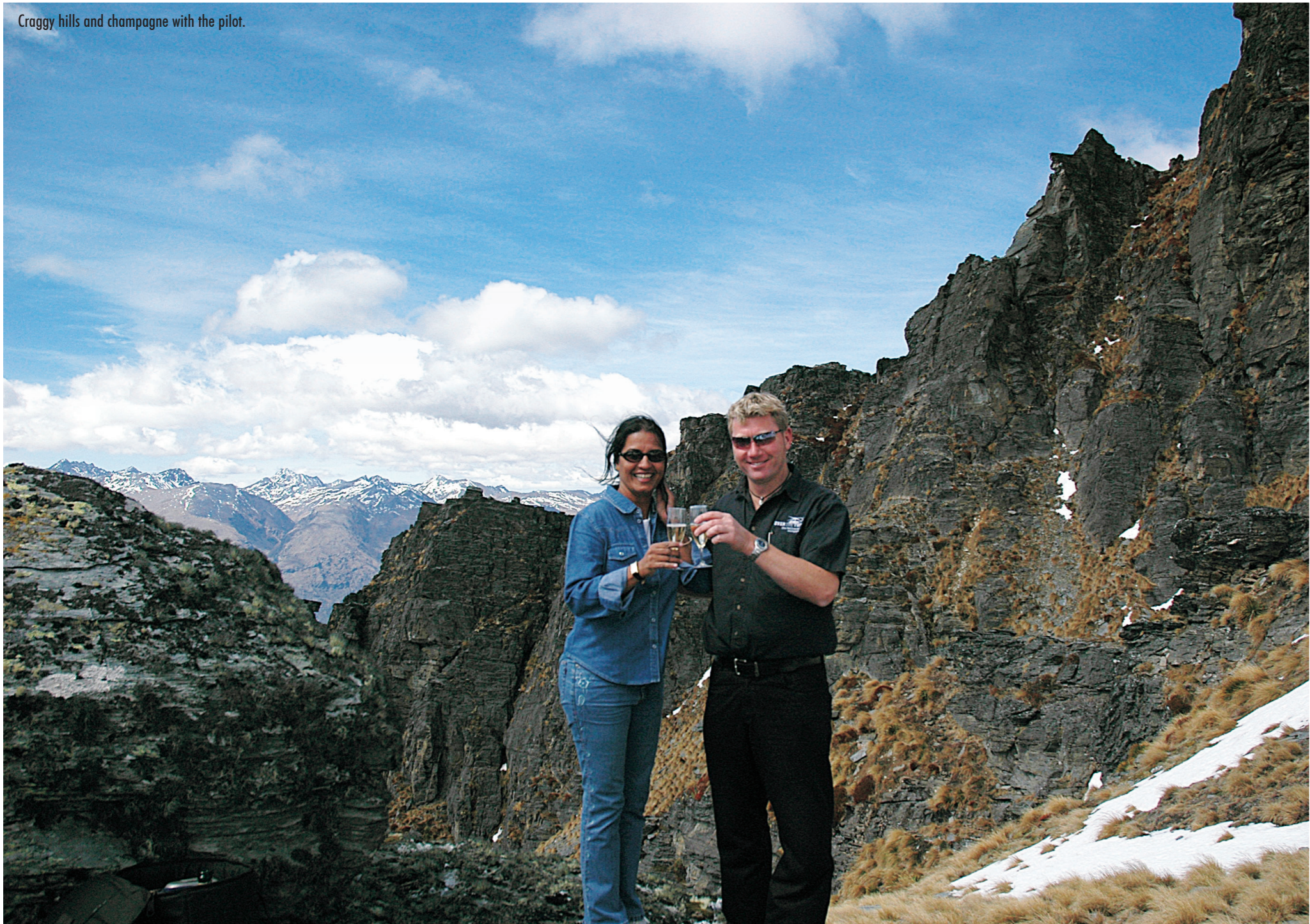
Craggy hills and champagne with the pilot.